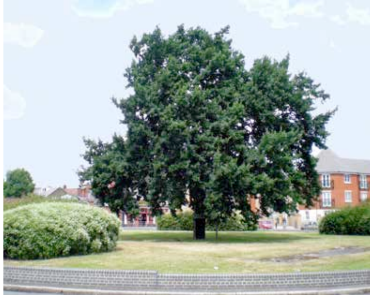
1951 Fairlop Oak on Barkingside roundabout