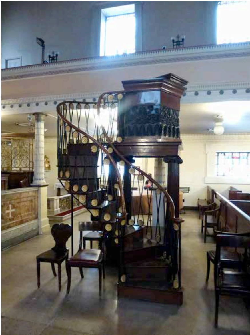
Pulpit in St Pancras Parish Church, London (near Euston Station)

An item made of wood from the Fairlop Oak