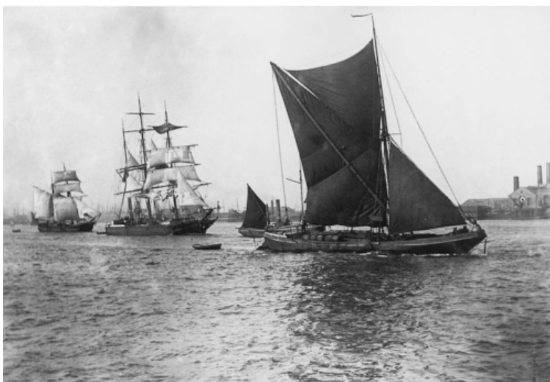
Image of late 18th/early 19th century sailing ship on the River Thames.